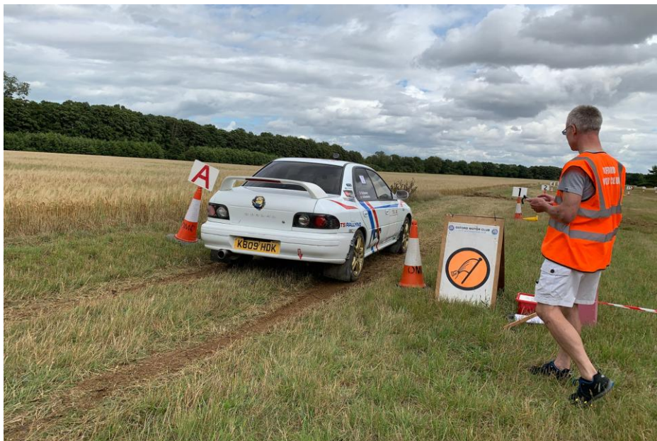
Grass Autotest.

The lockdown forced us to cancel the Bocardo Autosolo in April and the second running of the Bullnose Targa in June. In an attempt to get a Motorsport fix, a move online saw us run a number of online rally events on Dirt 2.0 which were well supported. While no substitute for the real thing, it kept some of us amused while our cars languished in their garages. Motorsport UK event permits finally became available in early July but we didn't know if people were ready to come out and support our July Grass Autotest. Fortunately, an online survey suggested most people were itching to get back out and compete after the long layoff. The event was very different from previous years. All entries had to be in advance and all documentation provided online. We also trialled the Sapphire online timing system which removed the need for physical timecards. There was also no barbeque, drivers briefing or awards, which gave the event a less sociable feel, but despite this, the event went well. The new timing system worked without a glitch, the weather was good, and everyone seemed to enjoy the day. This was of particular relief to me as it was my first time as Clerk of the Course for the event.