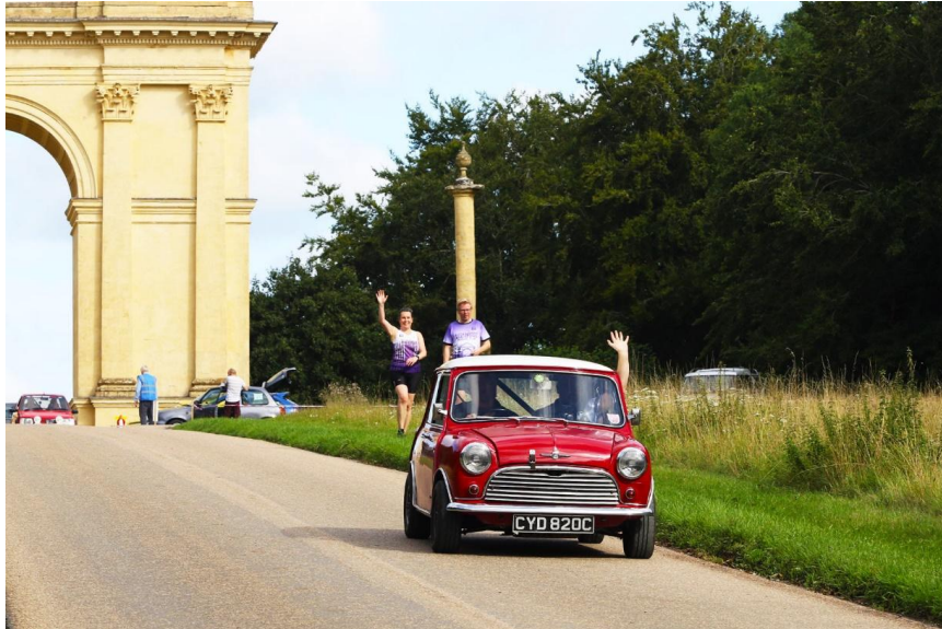
Akeman Start venue