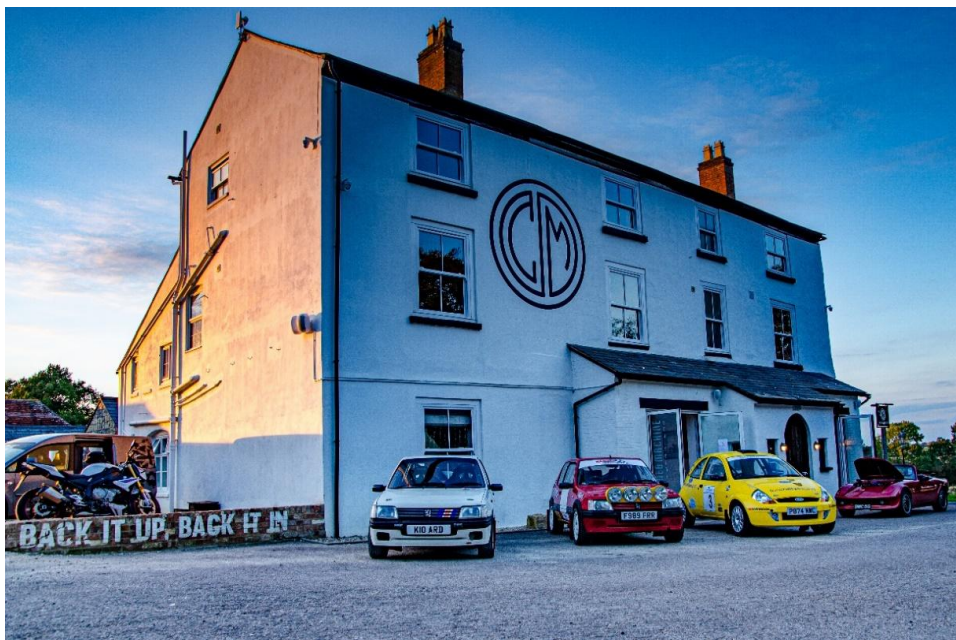
Caffeine & Machine.

With life seeming to become a little more normal, we held our September club night at Caffeine & Machine in Warwickshire. This was the first time we'd met up since early March and was well supported with around 25 people attending.